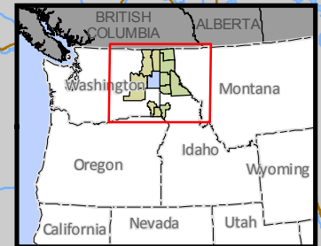
Service Area Location