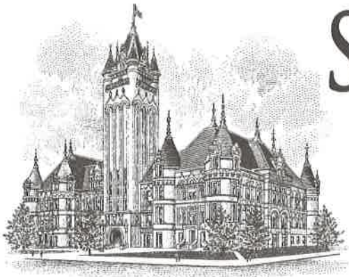
SPOKANE COUNTY COURT HOUSE