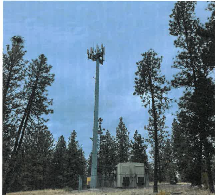
AFTER INSTALLMENT SCALE: N.T.S. 2