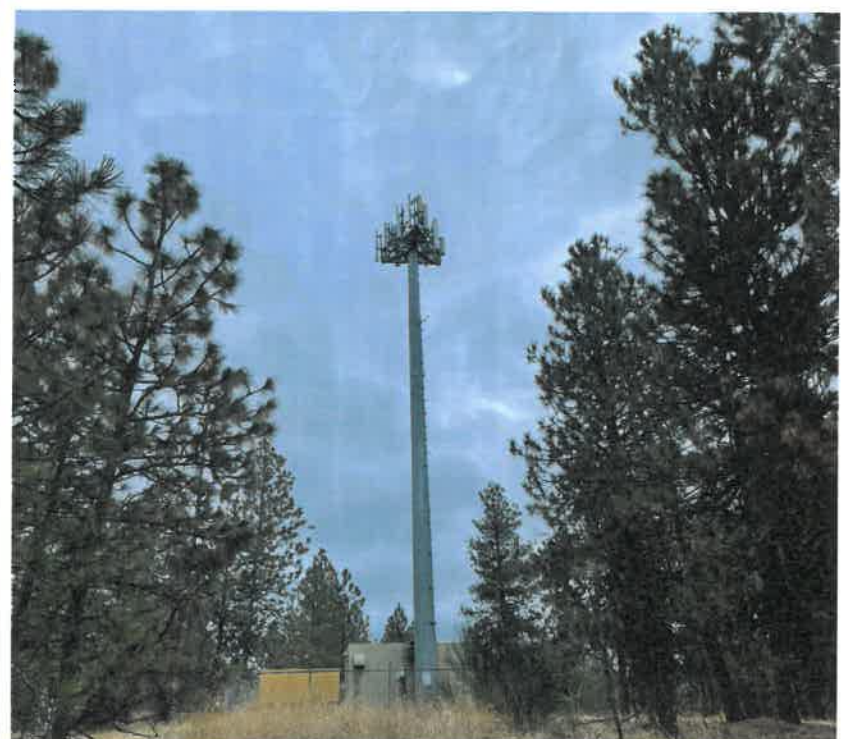
AFTER INSTALLMENT SCALE: N.T.S. 2